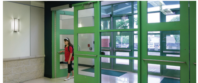
Future codes and standards will likely include requirements for automatic doors at some building entrances, depending on the occupancy type and occupant load.

the use of automatic doors to assist building occupants or as an alternative to the maneuvering clearances required for manual doors. The requirement for public entrances is intended to establish that when an automatic operator is required because of a project specification, owner preference, code or other mandate, an automatic operator (full powered or low-energy) must be used rather than a power-assist operator which reduces the opening force but still requires the door to be opened manually. The intent of the paragraph addressing vestibules is not to require automatic doors but to clarify that when automatic doors are installed and the exceptions for maneuvering clearance are applied to a vestibule, the doors must be full powered or low-energy automatic doors, not power-assist doors.