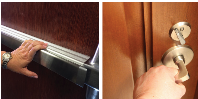
The ADA standards and ICC A117.1 still include different requirements with regard to the maximum force allowed for operable hardware.

requirement. The 2017 edition of ICC A117.1 includes a change that requires hardware operated by a forward, pushing or pulling motion to be operable with a force of 15 pounds maximum. Hardware operated by a rotational motion is limited to 28 inch-pounds maximum. The ADA standards may eventually be modified to remove the conflict, but for now, the two standards differ on operable force.