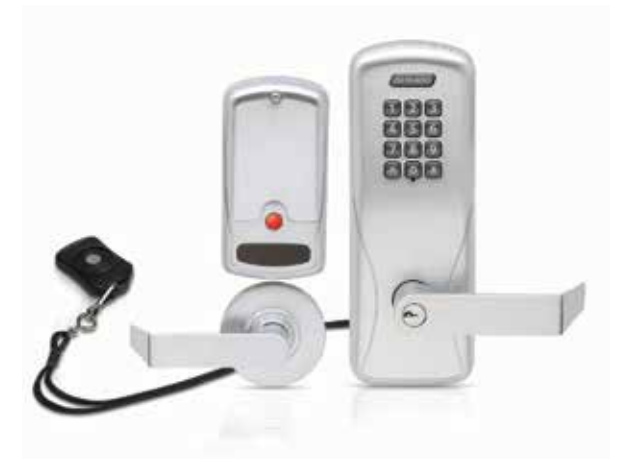
One option for classroom doors is an electrified lock that can be locked by pushing a button on a fob worn by the teacher.

The desire to react quickly and within budgetary restrictions sometimes leads to choices that may solve one problem but inadvertently create others. The requirements for free egress, fire protection and accessibility must be considered in conjunction with the need for security.