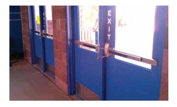
Exit doors in a school, chained to provide security. This locking method does not meet IBC, IFC, or NFPA 101 requirements for egress.

(Merriam-Webster.com). Most codes require doors in a means of egress to provide free egress at all times, which allows building occupants to evacuate quickly if necessary. Some proponents of barricade devices suggest that because the device is intended for use only when an active shooter is in the building, securing the door takes priority over allowing safe evacuation.